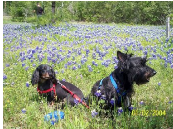
Right: Peanut and Tux pose in the Bluebonnets.