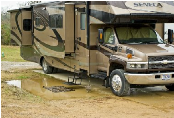
Left above: The Saffholms arrived days ahead of the campout to grab this prime waterfront site.