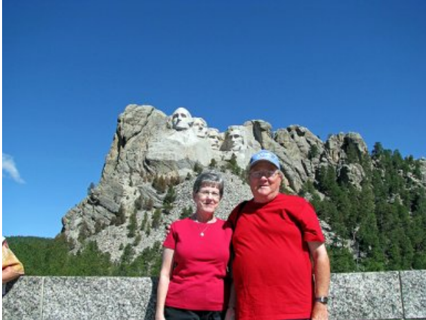
5. Above: _____