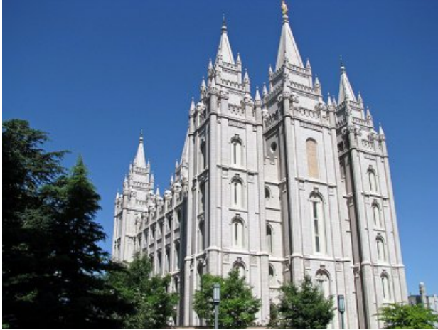
10. Below: _____