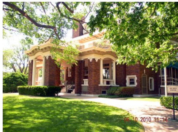
The Harrington House in Amarillo, TX