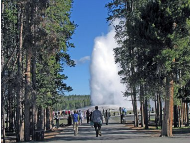
9. Below: _____