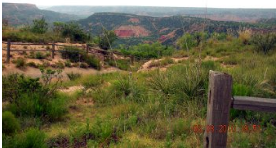
Palo Duro scenery.....

The next day, we ventured out to the Stockyards in Amarillo, and had lunch – "little steaks" at the locally well known Stockyard Cafe. Their definition of little is quite different than ours