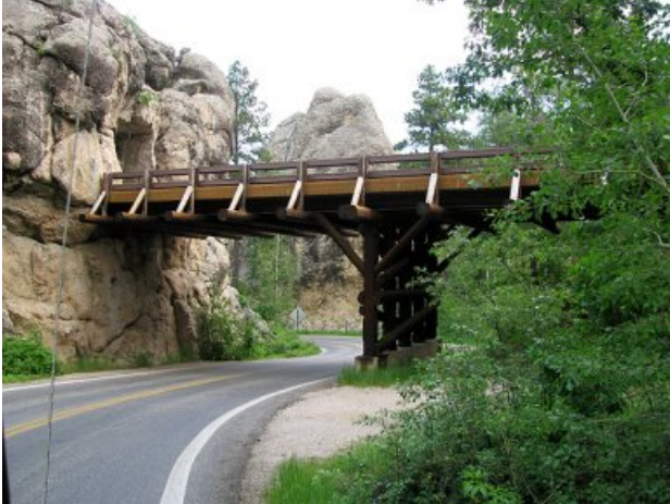
7. Above: _____