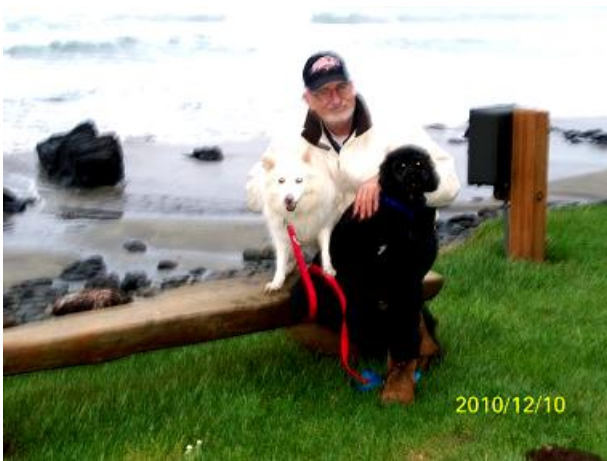
Mr. Good-Lookin' and his "Buddies" at Yachats, Oregon!