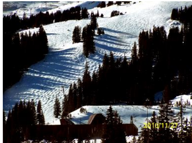
For the first part of our trip , we found snow in those Colorado mountains, and plenty of RV hookups available!