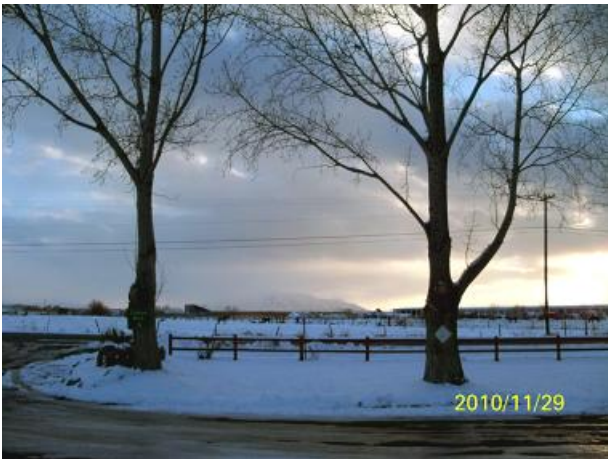
American Fork, Utah..... 2 degrees at night.....horses seemed fine in snow-covered field out of the RV window..... with no barn and no blankets.....I lost sleep over that!.