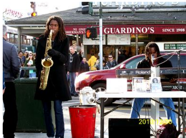
....."So I guess that's why they call it the Blues".... we could have stayed here all day..... so authentic, so real ;-)