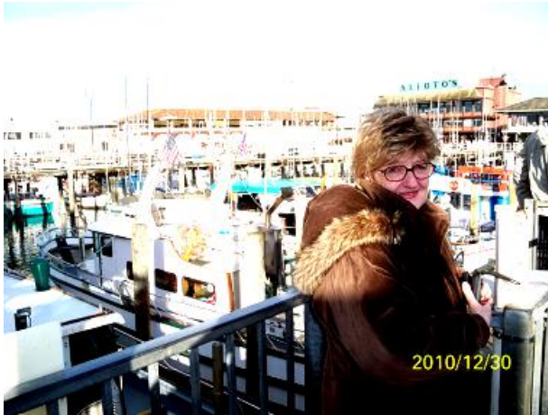
My ship came in.....which one of these is it?