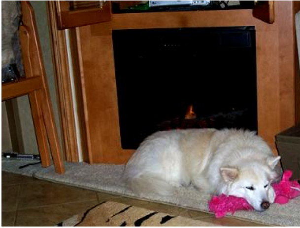
Sugar knows just how to get cozy: Rests her head on Shadow's favorite toy.....before her roaring fire!

Shadow's had a really hard day roughing it on the camping trail, but he's better here, after retrieving his favorite toy from Sugar!