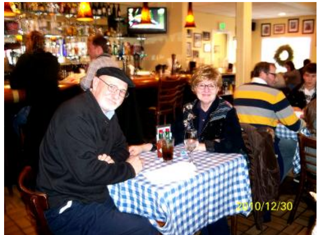
Seafood Gumbo at Fisherman's Wharf